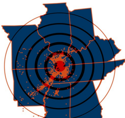
SF 19 Participation - 8 states along the New Madrid Seismic Zone.

In this exercise, a 7.7 magnitude earthquake struck along the Cottonwood Grove Fault, the southwest segment of the New Madrid Seismic Zone (NMSZ), near Memphis, Tennessee. Organizations from the whole community participated, including Federal, State and local governments, non-governmental and private sectors, as well as utility and critical infrastructure partners.