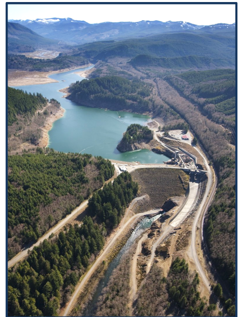
Howard A. Hanson Dam, (HHPD), completed in 1961 - King County, WA.

After a compliance review of state and local hazard mitigation plans for grant program applicants across the Nation, six states and one local