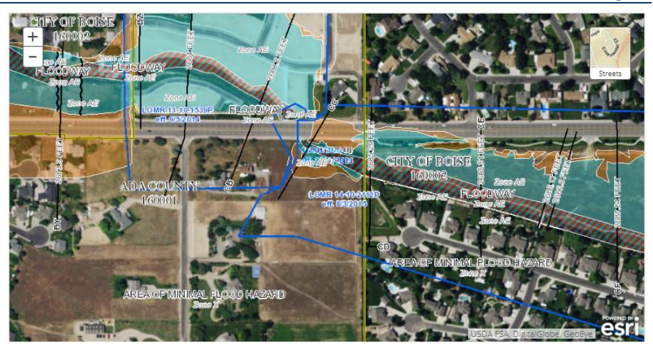
Dynamic view of the NFHL showing FIRM panel data, flood hazard zones, floodways, and the location of Letters of Map Change.

The National Flood Hazard Layer (NFHL) Viewer provides users with a powerful interactive flood map tool for the whole country. The dynamic NFHL shows the current effective information including LOMRs since the most recent flood map revision. The updated NFHL viewer enables community officials and members of the public to create on-demand printable maps of NFHL data using a FEMA-approved base map and a FEMA-defined map template. Users printable create NFHL FIRMettes or full-size FIRM panels from the NFHL.